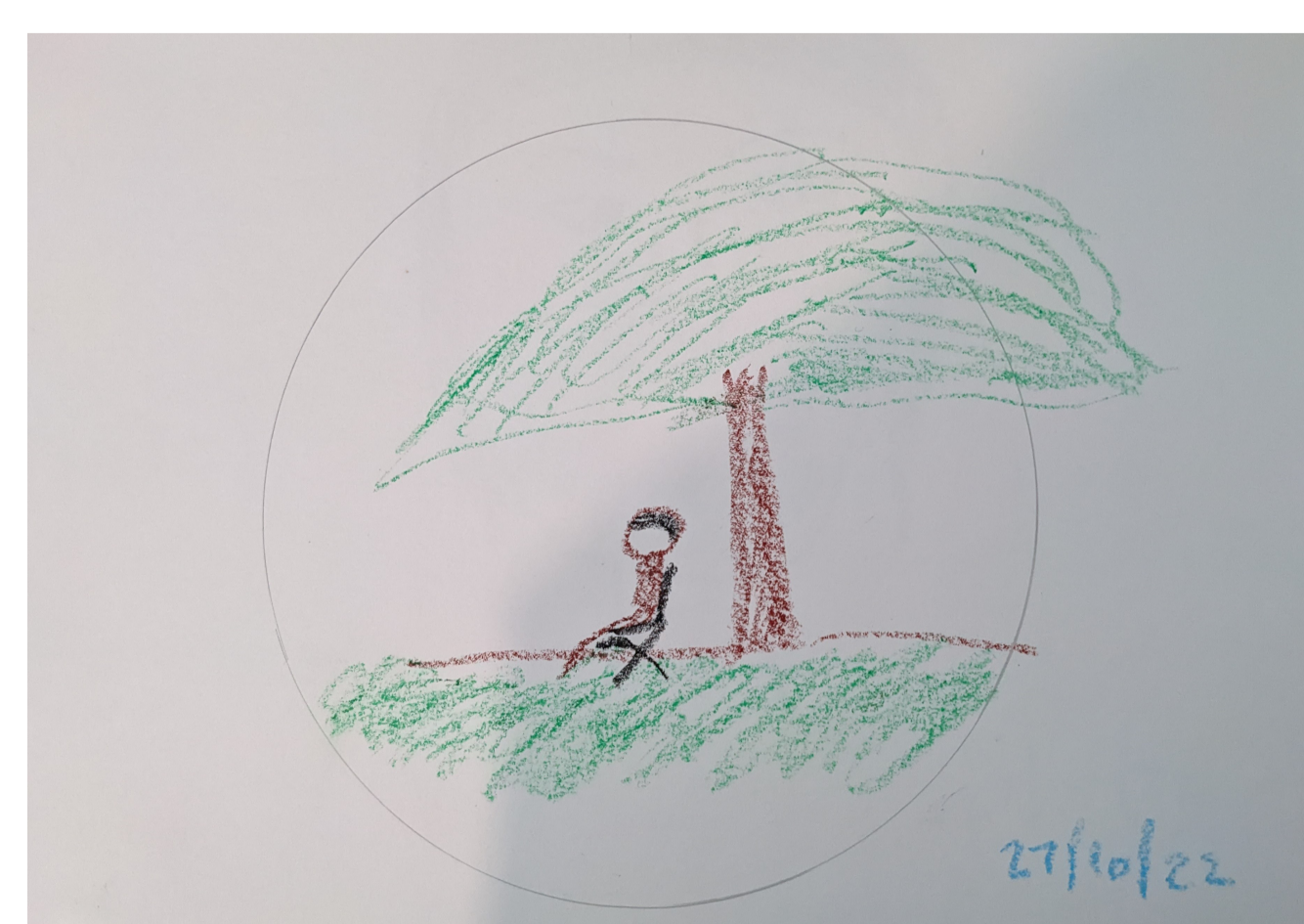
Figure 2: "My Peaceful Place"