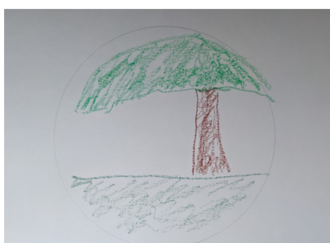
Figure 1: "My Resting place"